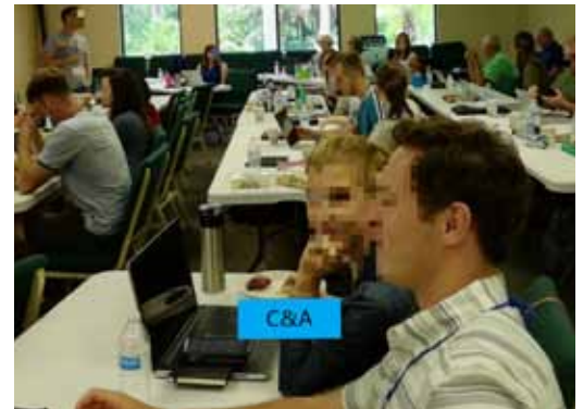
(see accompanying Alphabet Soup article)